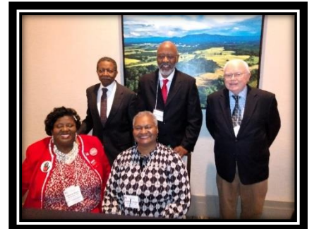
We had fun at the NARFE Conference, too!