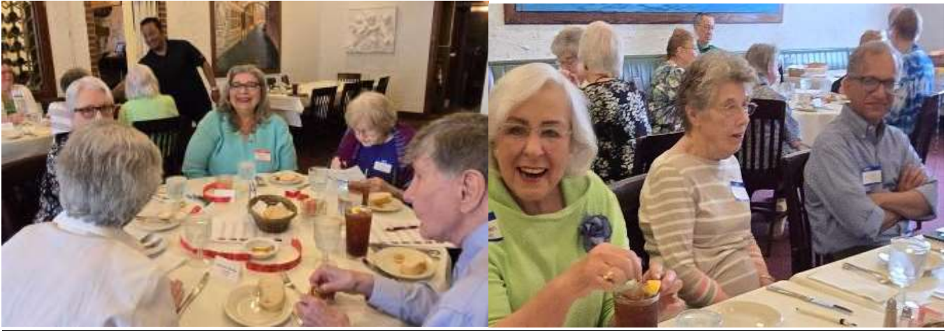
Chapter members enjoying each other's company at our Spring Luncheon

June Luncheon – We held our Spring Luncheon on June 5 th . The luncheon was at the Italian Café in Falls Church and 28 members and guests attended . It was a good time for all as members mingled and caught up on what everyone had been doing. A short business meeting also was held and the Chapter's 2025 Nominating Committee was approved. Raffle ticket sales and donations raised $580 for Alzheimer's Research.