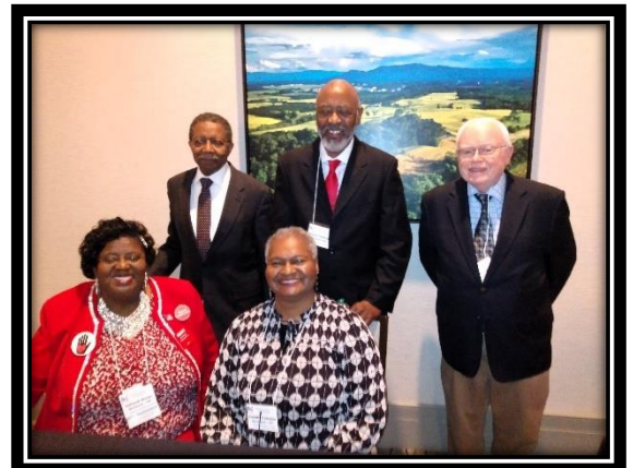
We had fun at the Narfe Conference, too!