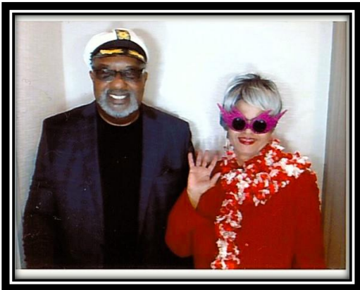
Some Area IV Photos and Conference photo.