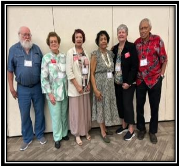
See you in Harrisonburg in April!