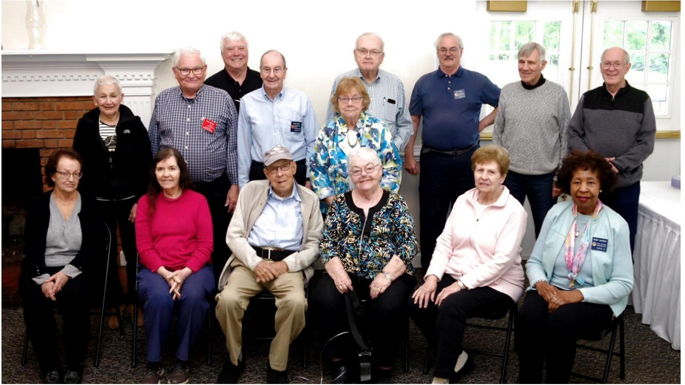
Participants at the May Membership lunch meeting and Clara Barton presentation