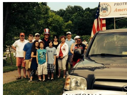
City the night