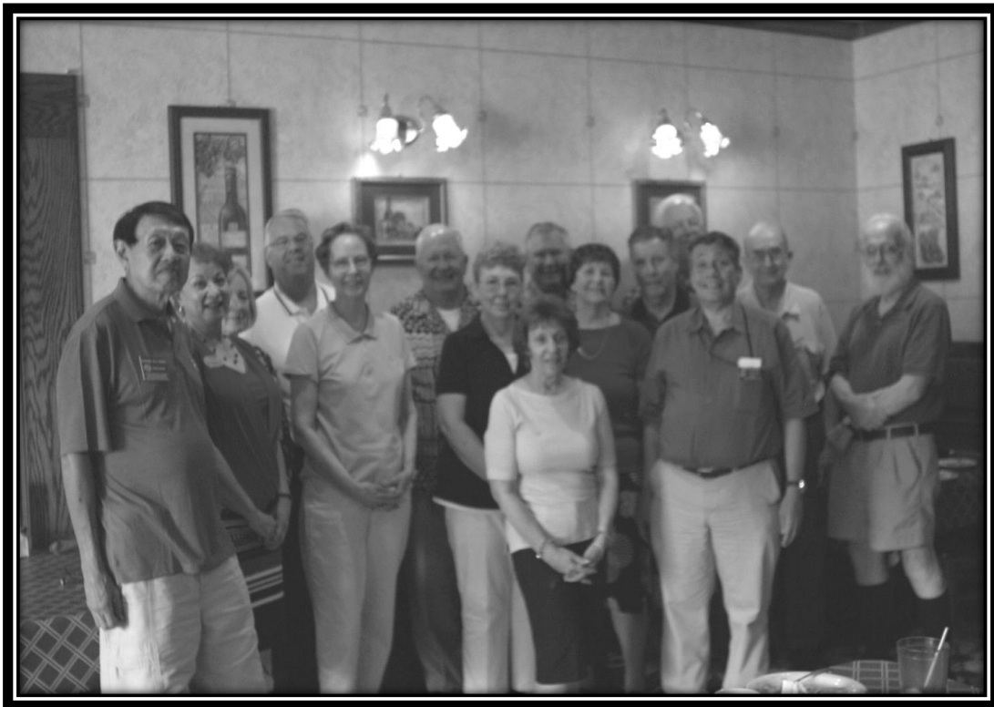
The 2015 VFC Convention Committee Members (pictured here) celebrated a successful convention at a luncheon at Paridiso's Restaurant in Alexandria, VA in May.