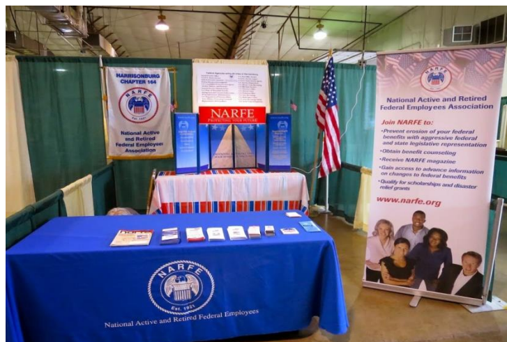
Photo of NARFE Booth at Rockingham County Fair

Colonial Heights Chapter 1472—DOD Schools Convention