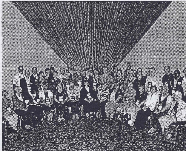
Virginia Delegation at the 2008 NARFE National Convention, Louisville, Kentucky

I'm anticipating a wonderful convention in May and am looking forward to meeting with many old friends and meeting new ones. The Convention Committee has put together a very exciting program that I hope to be able to report on in the next VFC Notes as the President of the Virginia Federation of Chapters.