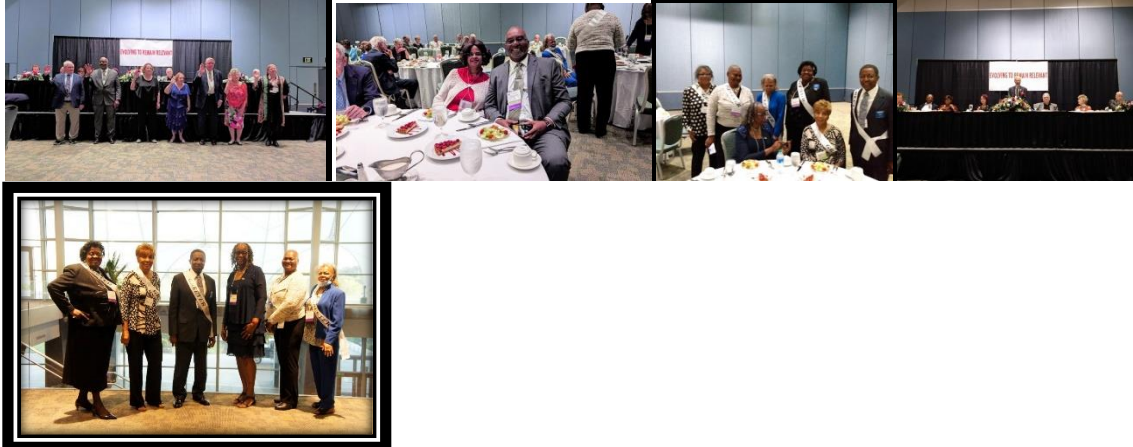
Photos of activities of Swearing in, the Banquet, Greeters, and meetings.

We attended the Virginia Federation of NARFE (VFN) Annual Meeting and Conference. We had chapter members as greeters every day and they did a wonderful job.