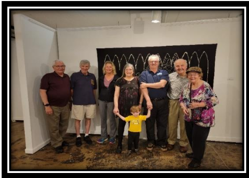
Fairfax group visited Workhouse Art Center in Lorton.