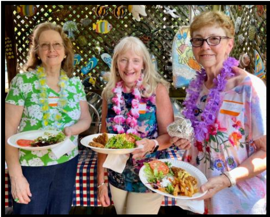
Springfield Chapter enjoys its Annual Summer Luncheon >>