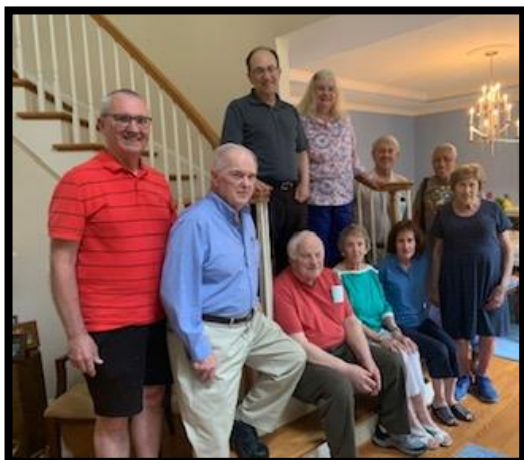
Other events included an ice cream social, and a chapter picnic (a few members pictured here).