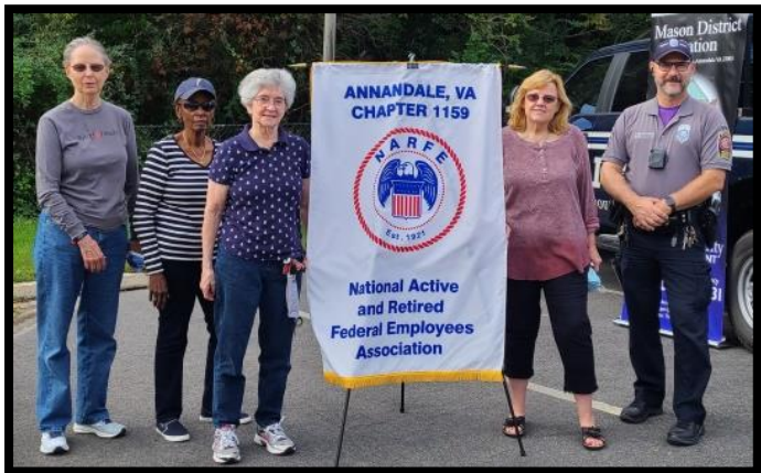
<<<<< Annandale Chapter participates with Fairfax County Police in its Food Bank collection

All chapters continue to excel in Alzheimer’s fundraising; they support the Northern Virginia Caucus which holds a quarterly meeting that follows each quarterly VFN Board meeting; they support social interactions within their membership with planned spring/summer/fall activities, including theater engagements by Springfield and Woodbridge Chapters; an Adopt-A-Road cleanup by Springfield Chapter; and spring luncheons by Springfield and Annandale Chapters.