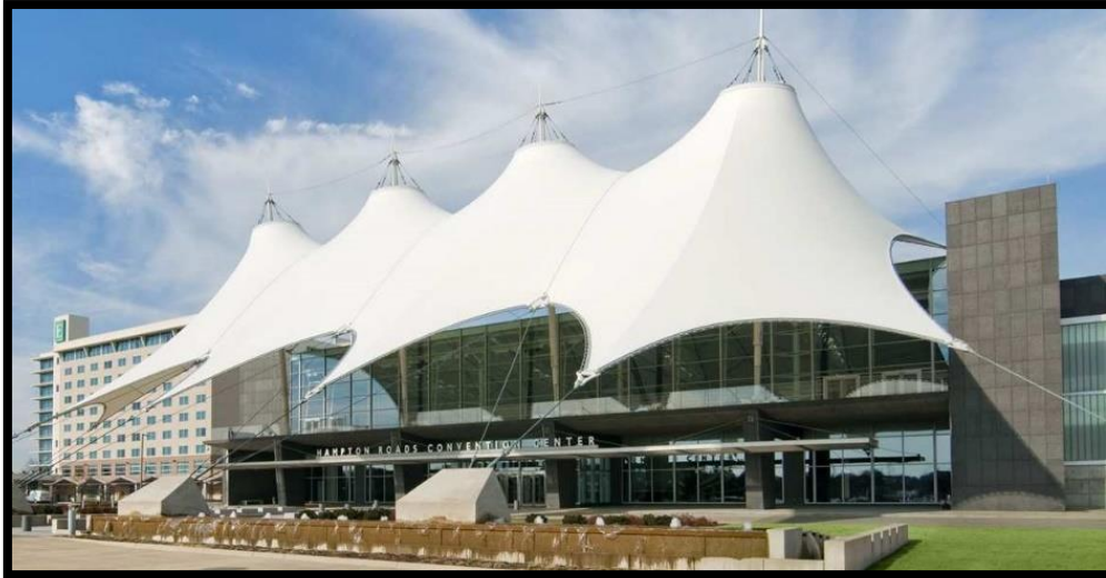
Embassy Suites & Conference Center

HOTEL/CONFERENCE INFORMATION Embassy Suites by Hilton Convention Center 1700 Coliseum Drive Hampton, VA 23666