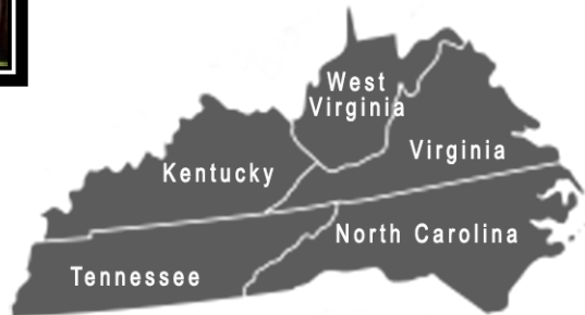
Map of Region X

Virginia is part of Region X. We also heard from three of the four candidates for NARFE National President (pictured below):