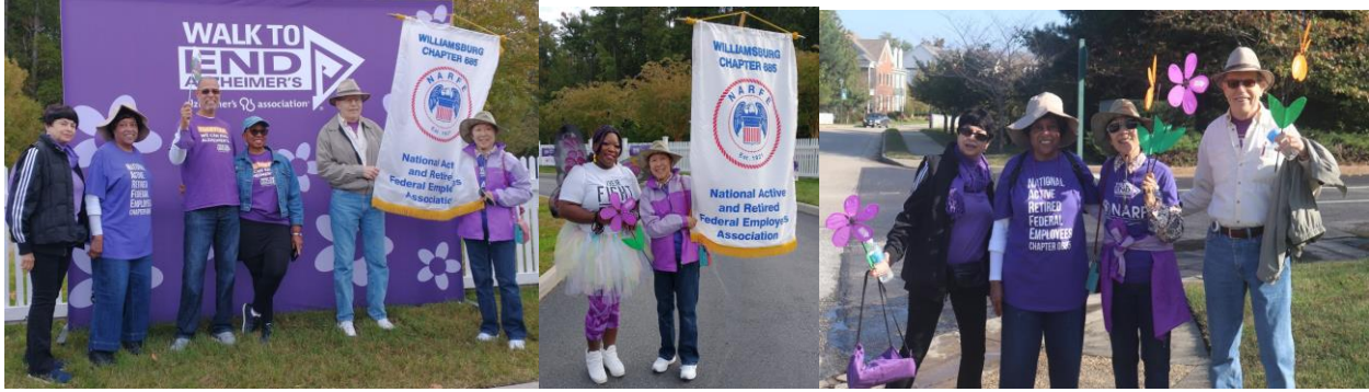
October Walk to End Alzheimer's.